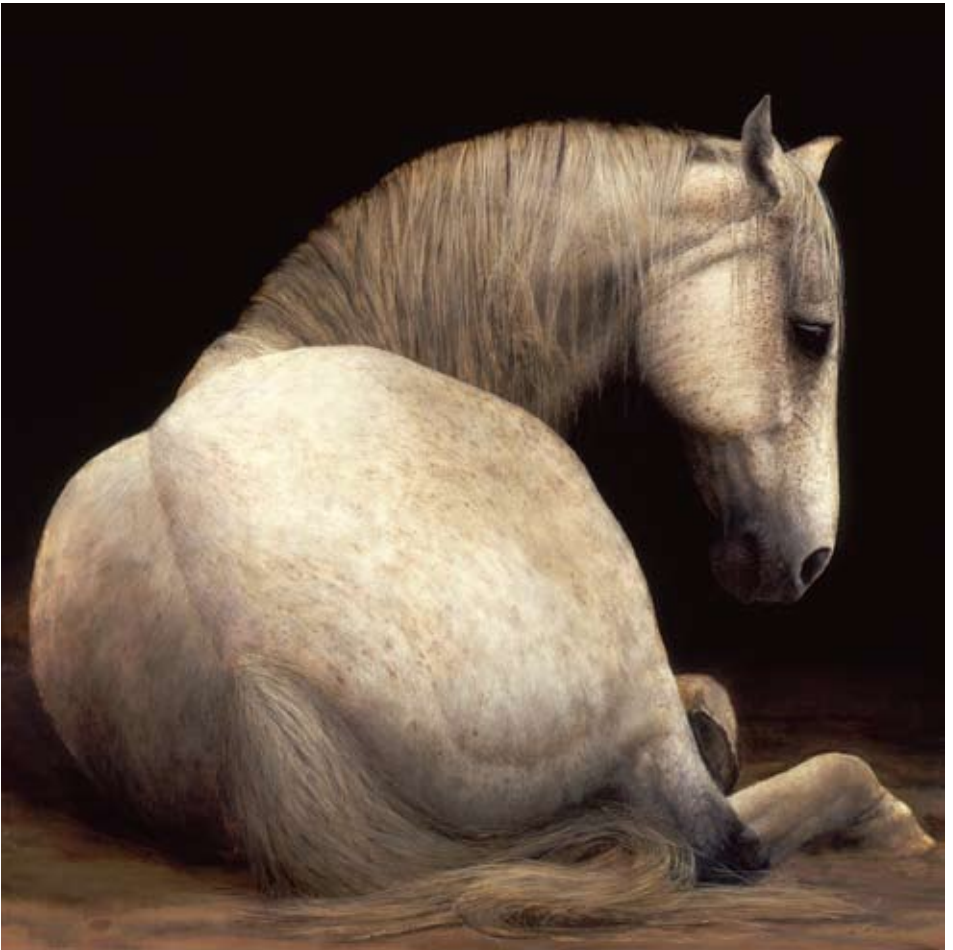
COBAHSAAN RESTING HIS LAMINITIC FEET