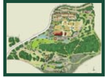
Monterey Horse Park Plan

The MHP is also pleased to announce that the property has undergone early transfer from the army to the Fort Ord Reuse authority. This means it will undergo clean up in the very near future and should speed the completion of the project.